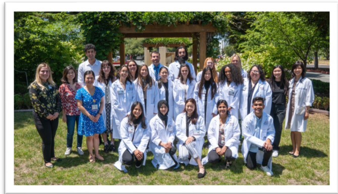
Class of 2023-24