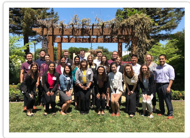
Class of 2018-2019 Fellows